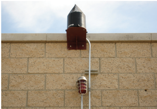
Rain collector switch and alarm light.