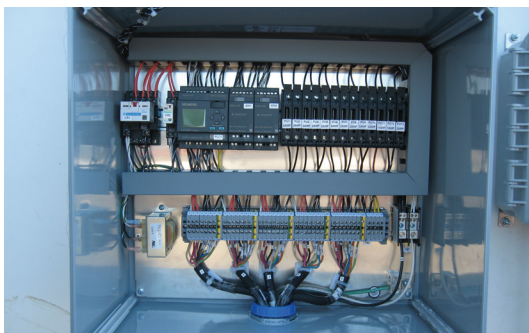
Interior view of control panel.