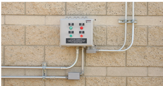
Wall mounted control unit.