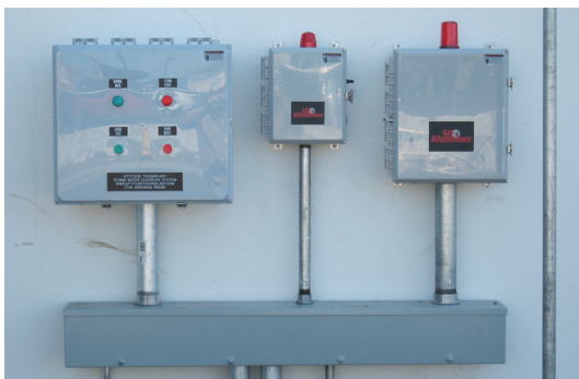
Multiple panels for complex applications.